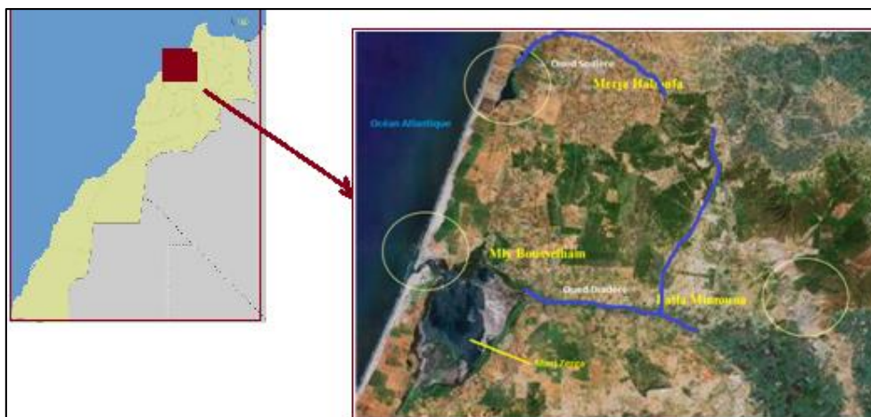
Fig 1: Location of the Drader - Souier watershed on the Gharb map [5] .

Drader River is a river that drains the Drader - Souier watershed. The upper course of this river, of North - South direction, is temporary and is in the form of a small stream, whereas its middle and lower course, of East - West direction, is permanent and profits from the spills of resurgences of the river tablecloth of Dhar El Hadechi on its right bank and El Fahis on the left bank [4] . The average discharge of the Drader River in the vicinity of the Merja Zerga is of the order of 1 m 3 /s, whereas during the low water period its flow drops to 600 l/s. 30% of the annual contributions of the Drader river are attributed to the emergence of the water table [4] .