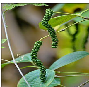
Fig 1: Plant of Black pepper

Piper nigrum (Black pepper) plant is a flowering woody perennial climbing vine that belongs to Piperaceae family. Pepper plants easily grow in the shade on supporting trees, trellises or poles up to maximum height of 13 feet or 4 meters and roots may come out from leaf nodes if vine touch to the ground. The plants have heart shape alternate leaves with typically large size of 5-10 cm in length and 3-6 cm across, with 5 to 7 prominent palmate veins. The flowers are small, monoecious with separate male and female flowers but may be polygamous which contain both male and female flowers. The small flowers are borne on pendulous spikes at the leaf nodes that are nearly as long as the leaves. The length of spikes goes up to 7-15 cm. The black pepper's fruits are small (3 to 4 mm in diameter) called a drupe and the dried unripe fruits of Piper nigrum are known as a peppercorn. The fully mature fruits are dark red in color and approximately 5 mm in diameter. A fruit contains a single seed. The plants bear fruits from 4th or 5th year, and continue to bear fruits up to seven years. A single stem contains 20-30 spikes of fruits. The collected spikes are sun dried to separate the peppercorns from the spikes. The fresh harvested unripe green fruits may freeze-dry to make green pepper. The fresh harvested unripe green fruits may sun-dried to make black pepper. The red skin of the ripen fruits is removed and the stony seeds are sun-dried to make white pepper.