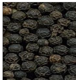
Fig 2: Black pepper