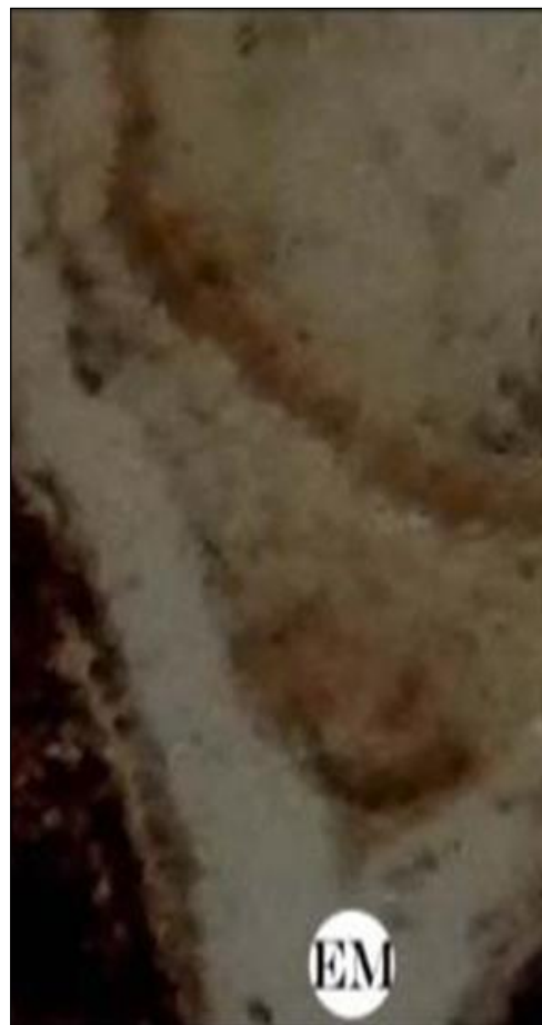
Fig 3: Pericarp shows woody projections on fruit wall.450X