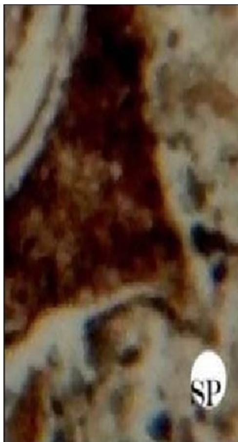
Fig 4: Details of Embryo (EM). 450X