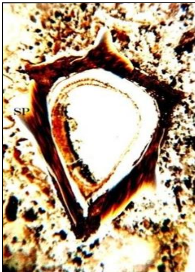
Fig 1: Enlarged unilocular fruit with seed. 450X

Fibers are abundant forming the ground mass of the wood. They are thin walled and are compactly arranged in radial rows between the rays without any intercellular space. (Fig 5-7). Fibre cells are non-septate. They measure 27µm in height and 16µm in diameter.